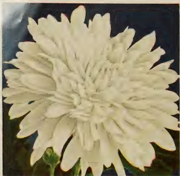
© AVALANCHE. 50c each; 3 for $1.25